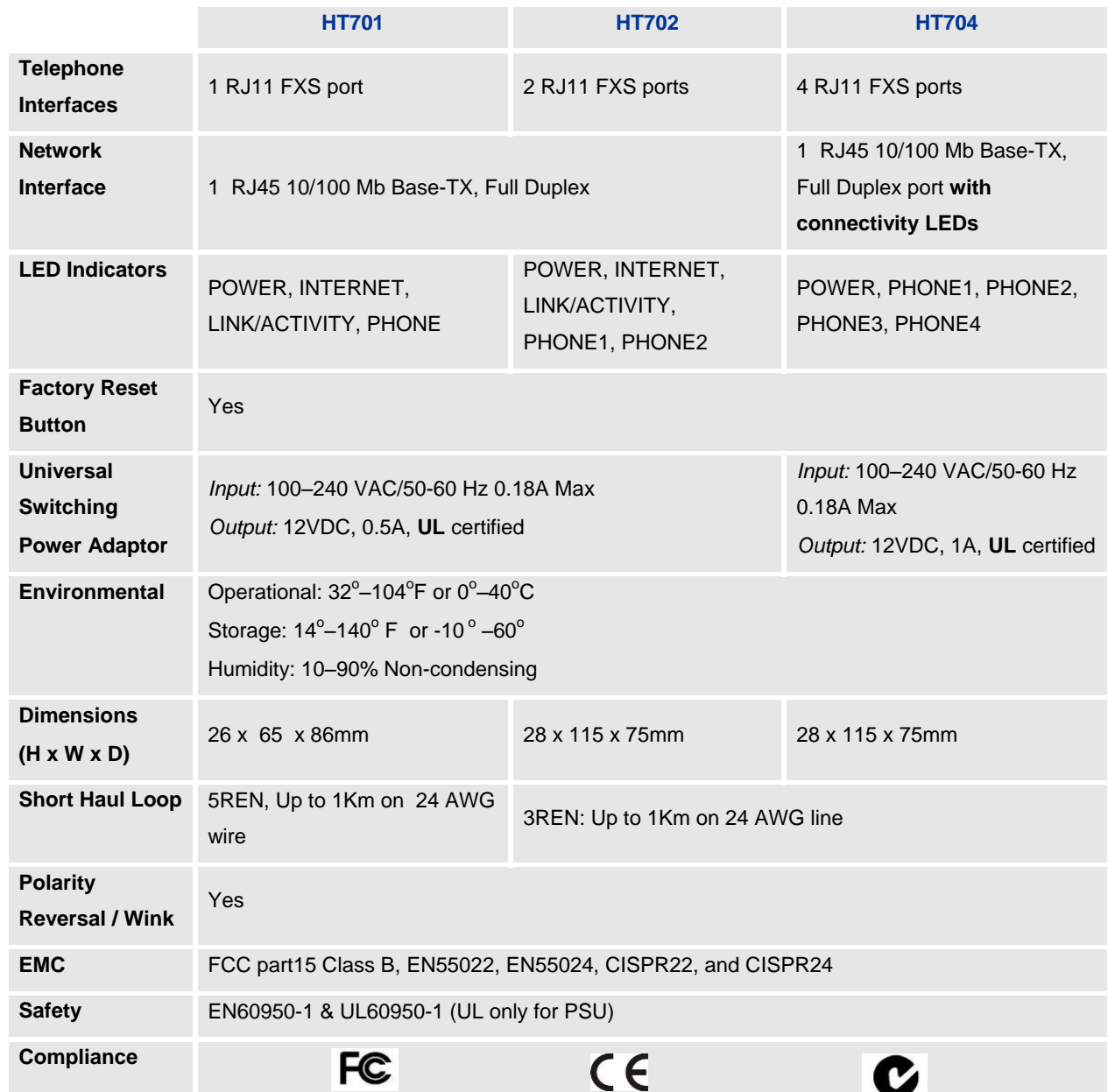
TABLE 5: HT70X HARDWARE AND TECHNICAL SPECIFICATIONS

The table below lists the Hardware and Technical specification of HT70X.